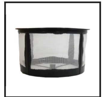
8" RAINWATER FILTER BASKET